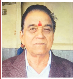
Late Hon'ble Wasudeorao .V. Ragit