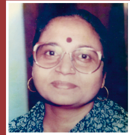
Late Hon'ble Shobha. W. Ragit