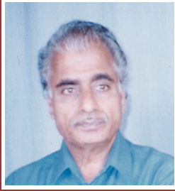
Late Hon'ble C.A.J Iyer